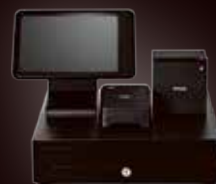
Point of Sale Systems Recommendations, Solutions & Integrations