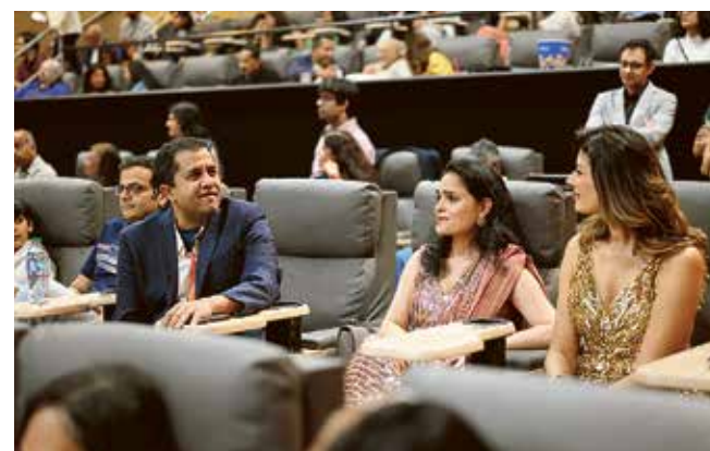
Actors Omi Vaidya and Pooja Batra, right.